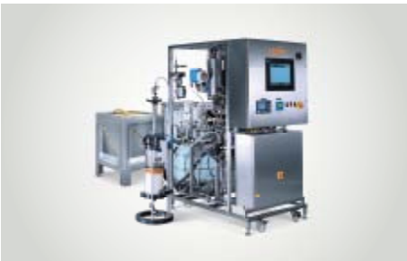
LEWA EcoPrime LPLC Systems for low pressures to optimize purification processes with the highest precision. Can be used as buffer inline dilution systems or stand-alone chromatography systems.