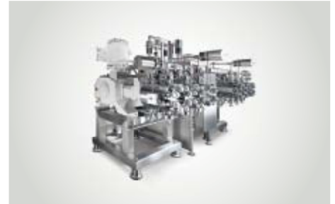
LEWA triplex hygienic Process diaphragm pumps for high pressures and critical, toxic, flammable, thin fluids, non-lubricating fluids, or abrasive suspensions.