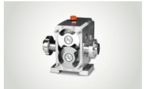
Pomac* Rotary lobe pumps for hygienic standard applications up to complex sterile applications with thin fluid, viscous or shear-sensitive media.