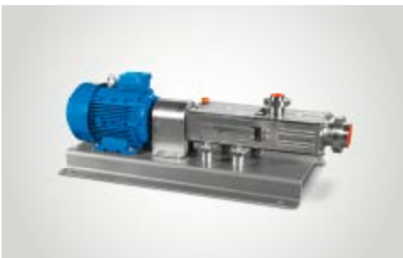
Pomac* Stainless steel double screw pumps are very flexible and self-priming. Suitable for sensitive media from thin to highly viscous with pieces up to 30 mm – as CIP and product pump.