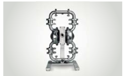
WILDEN hygienic* Compressed air pumps for the gentle transport of shear-sensitive products in the hygiene and sterile sectors