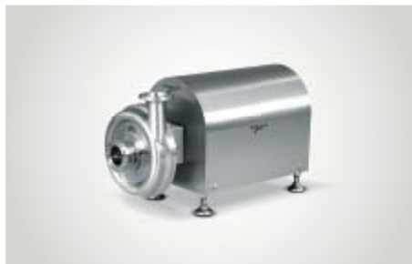
Pomac* Stainless steel centrifugal pumps for thin fluid media in the hygiene sectors