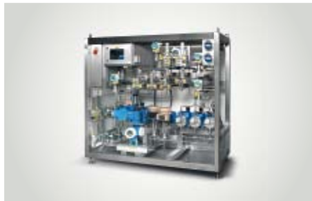
LEWA EcoPrime HPLC and SMB Systems for high pressures and industrial purification processes. Layout possible as batch HPLC or continuously operating chromatography systems.