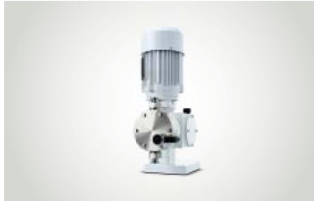
LEWA ecodos hygienic Diaphragm metering pumps for low pressures in the pharmaceutical, cosmetics, and food industries.