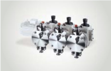
LEWA ecoflow hygienic Diaphragm metering pumps in a flexible modular system for medium to high pressures in the pharmaceutical, cosmetics, and food industries.